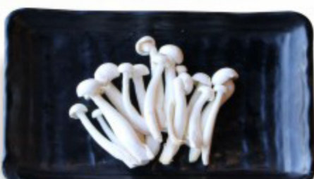
White Beech Mushroom $2.5