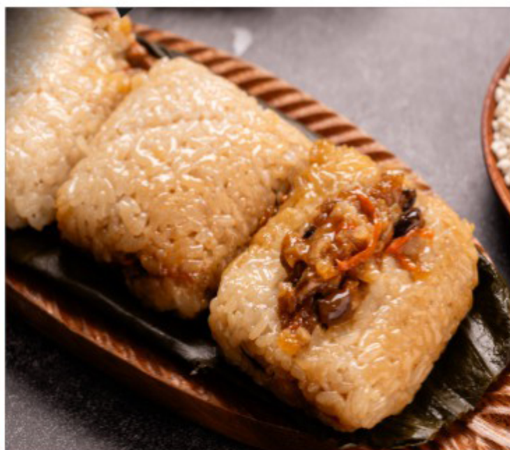
Savory Vegetables in Sticky Rice (3pc) $7.99