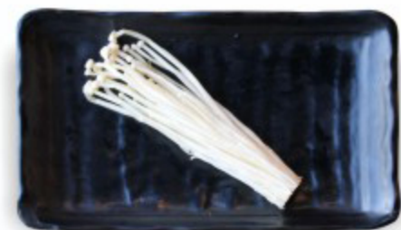
Enoki Mushroom $2.5