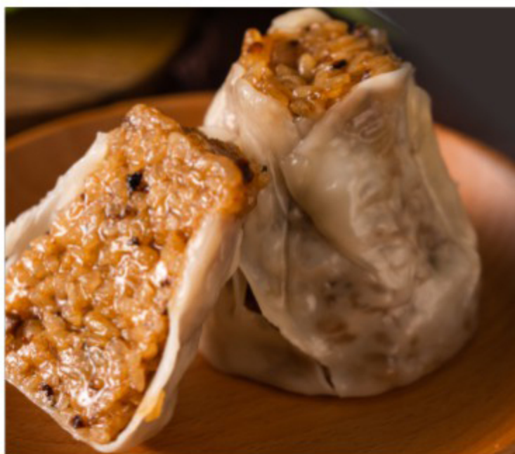
Sticky Rice Steamcd Shumai (6pc) $7.99