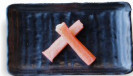
Imitation Crab Meat $1.5