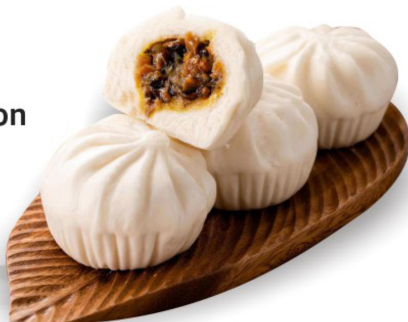
Mixed Mushroom Bun(4pc) $9.99