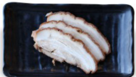
Chashu Pork (2 pcs) $2.5