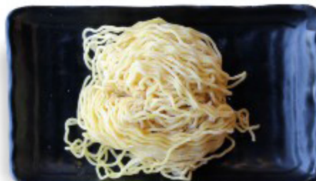
Extra Noodles $2.5