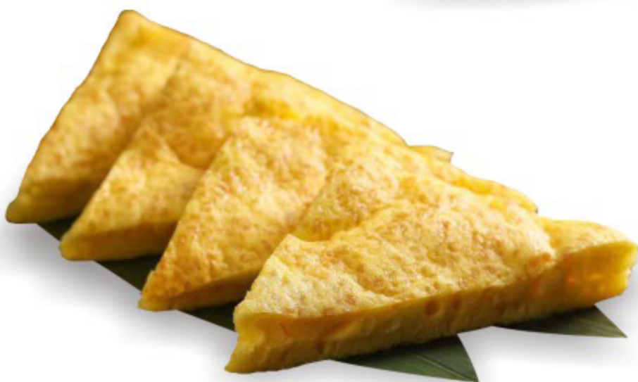
Ballet Cake (4pc) $8.99