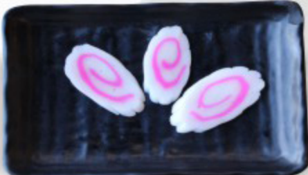
Fish Cake $1.5